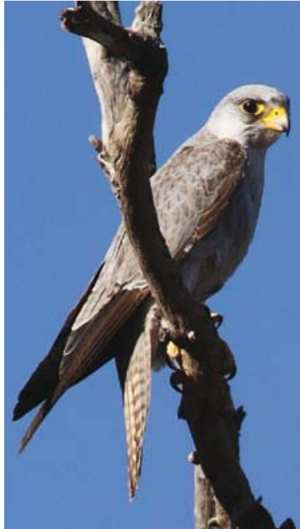
Presumed female Grey Falcon, Alice Springs, NT, September 2011