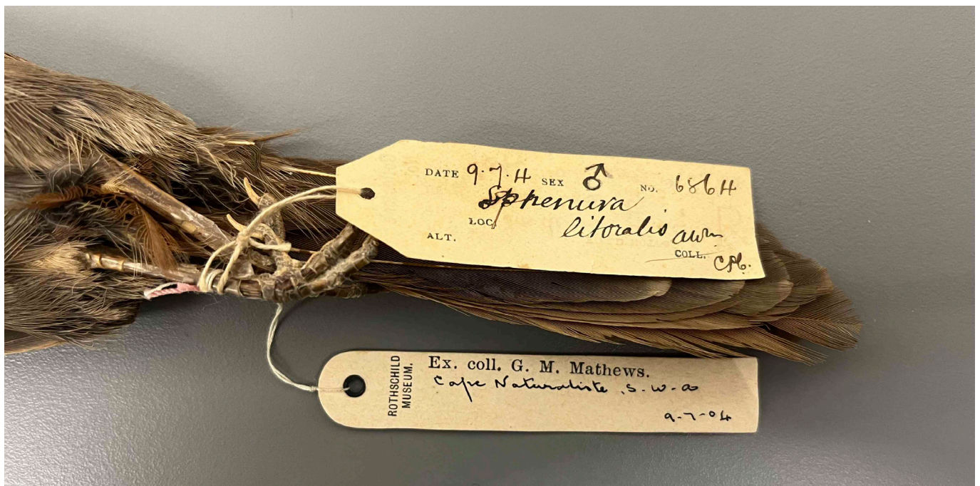
Figure 2. Label for Western Rufous Bristlebird Skin 598149 in the American Museum of Natural History showing the number 6864 corresponding to the original accession number in the Western Australian Museum.

Ashby (1921) also revisited Ellensbrook, in 1921, and noted that the Western Rufous Bristlebird was not encountered. He also noted the changes in habitat, referring to a reduction in density and a halving in height of vegetation (from “four feet to 18 inches or two feet”: p. 123) from frequent fires and grazing. Ashby speculated that the Western Rufous Bristlebird might have persisted in the