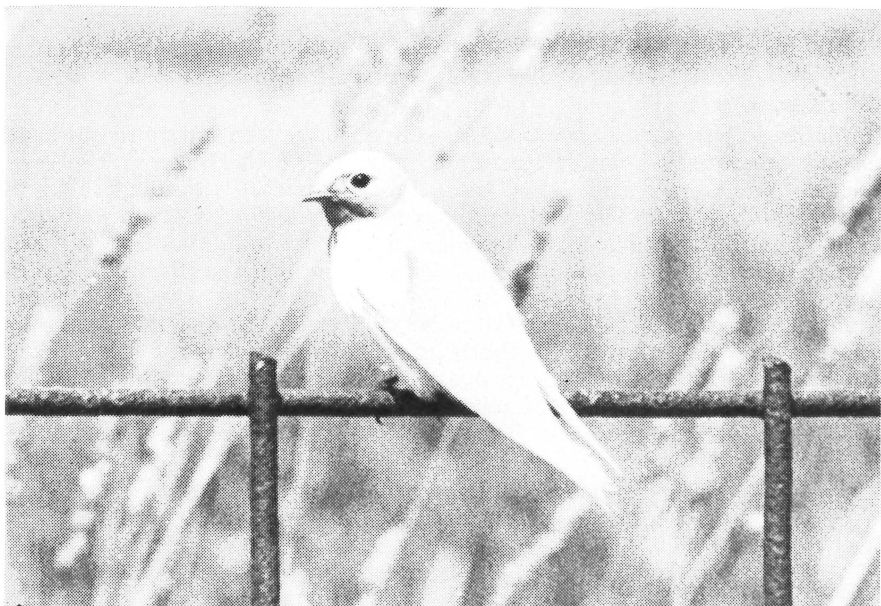
Albino Welcome Swallow Hirundo neoxena , Werribee, 11 February 1984